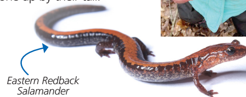
Eastern Redback Salamander

The Robert Williams Property is home to the Eastern Redback Salamanders. These salamanders lack lungs, absorbing oxygen through its skin. They are entirely land-dwelling salamanders found commonly under leaf litter; they rarely go into the water. They can shed their tail if grabbed by a predator, so make sure to never pick one up by their tail.