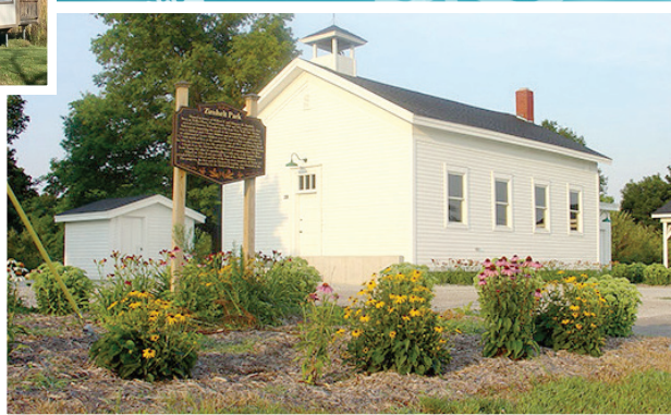
▲ Kitchen School is a beautiful historic site. Includes an outdoor pavilion.

For more information or to book your private rental call 810-214-1810 or log on to DTParks.com